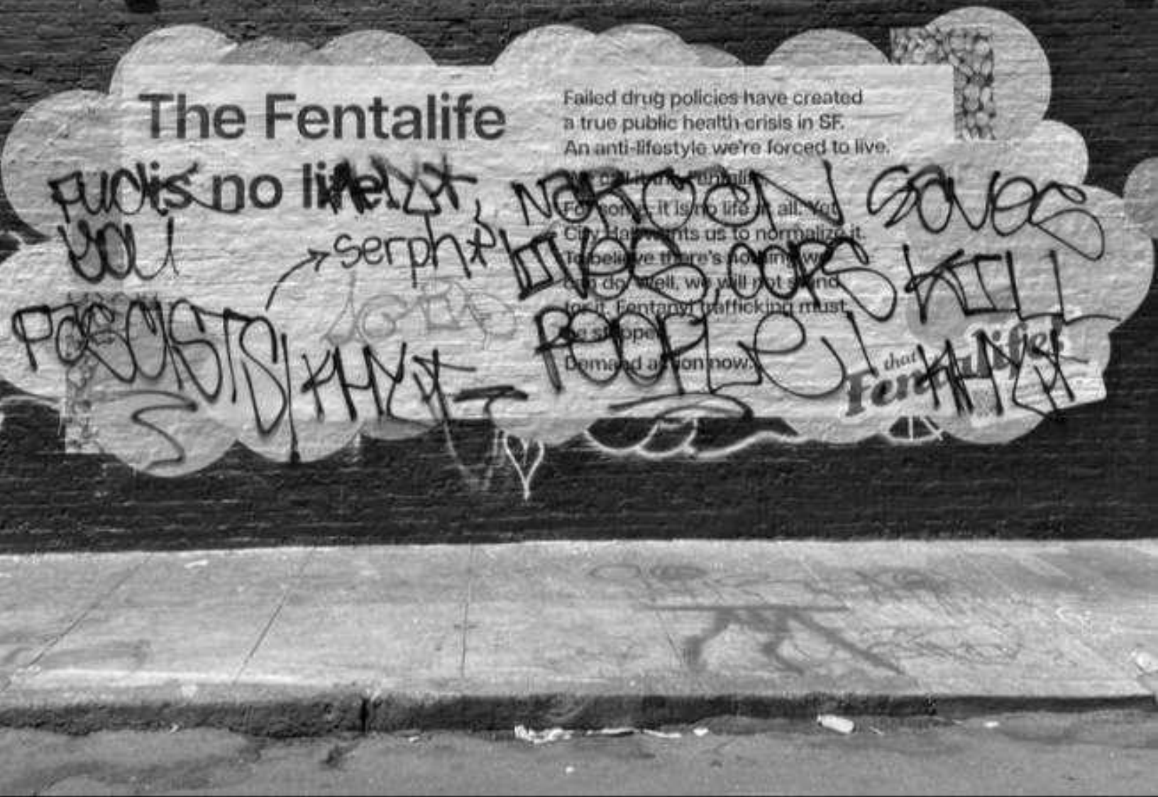
Graffiti reads, "Narcans Saves Lives, Cops Kill People!" "Fuck Your Fascists!"

Capitalism offers no solutions – only more police in an attempt to keep everything from falling apart. What is needed are movements, struggles, and actions from below which meet our needs directly, outside and against the interests of the rich who control and benefit from this disaster.